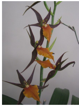
Jo Church [37]