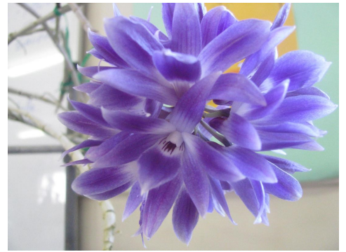
Open Popular Vote—Brian & Lynne Phelan [21 ]