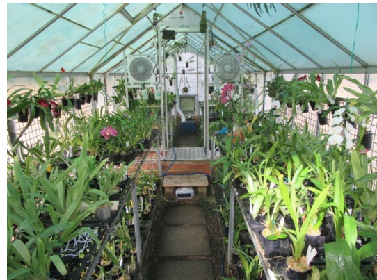
Glass house ^ and shade house [ below]

Here's Lynne & Brian Phelan's [ Open] orchid growing areas.