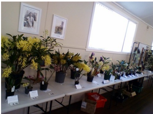
Stunning display at the August meeting of dendrobiums.