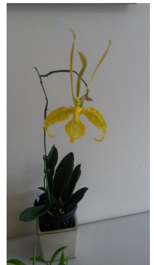
Jo Church Equal 2nd Novice