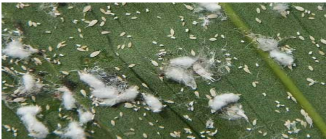
The mealy bug.

After having tried dabbing them with metho [ burns the leaves, left the plant looking sad and took a long time to bounce back] and then treating with insecticide, I moved on to cotton wool bubs dampened with water or confidor & water, to wipe off the thick white infestations. Once done, spray all the foliage with confidor spray [ I think it's 5mls/litre]. If it's in the potting mix as well then water with confidor mix or re-pot and then water with the mix. Keep this up until all bugs are gone. Most plants will just need a quick wipe and spray.