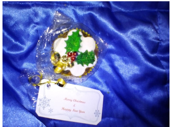
We each got a mini cake as a gift [ thank you to the giver. :) ]