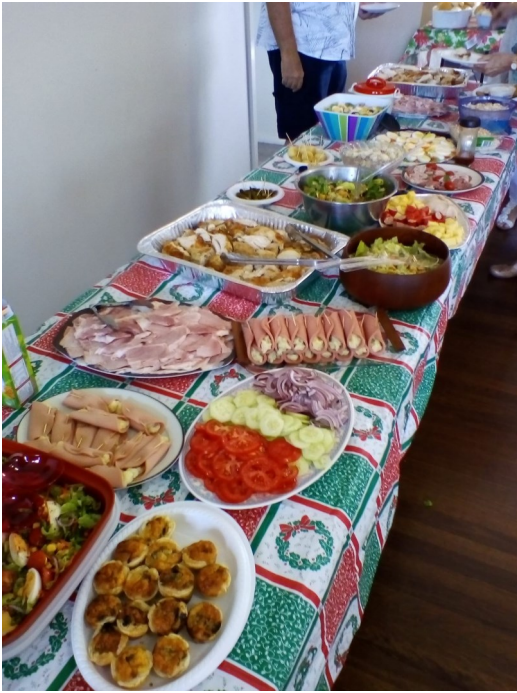
The food was plentiful and scrumptious. [There was more but it wouldn't fit in the picture].

The Christmas Party went very well. There were great raffles and we each got a lovely orchid seedling. Plus the company was friendly—full of Christmas cheer. The entertainment was enjoyable although the trivia comp. was a tad difficult. :) A.M.