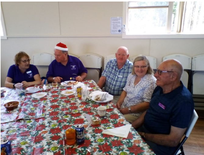
There was lots of chatting and people changing seats, to talk to fellow members. Decorations every where made it festive.