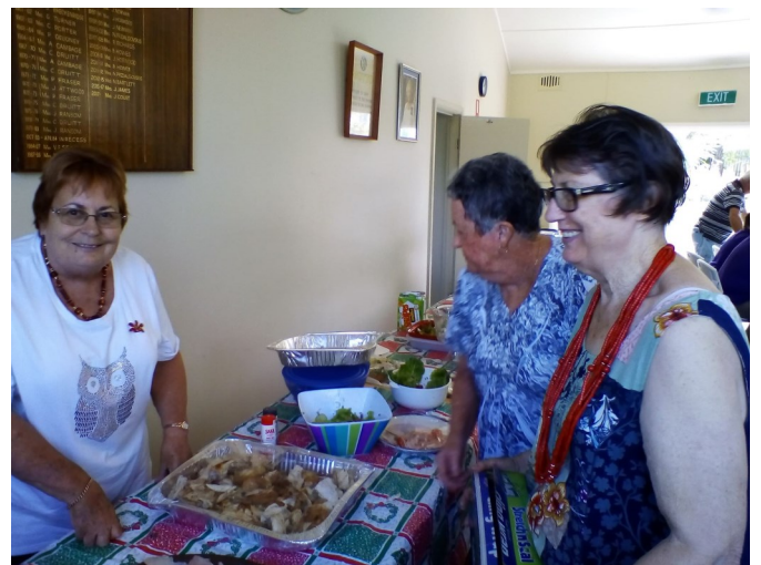
Thank you to the many helpers. We appreciate your efforts.