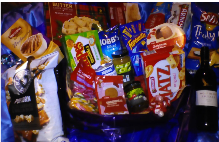
Third prize in the raffle was this hamper—I won it. :) Page 2