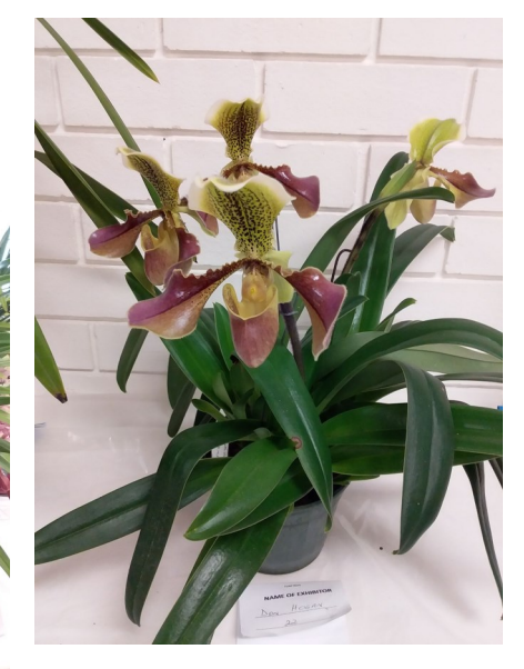
< -- Intermediate Jo