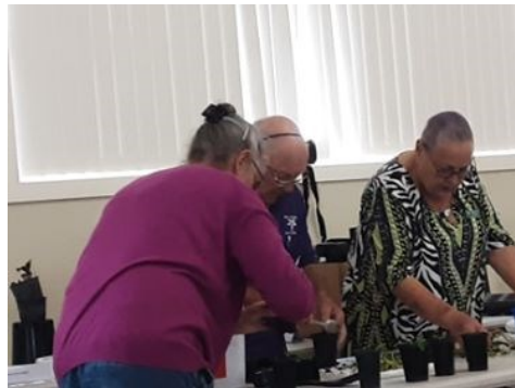
Helpers potting up the baby cattleyas.

At our March meeting, we will be participating in a deflasking exercise, breaking into small groups to develop our skills. There will be help available. On page 3, there is a series of step by step pictures to help us. This will be an interesting and valuable experience. : ) AM