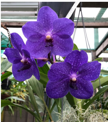
12. V. Pachara Delight 'Nakorn Blue'