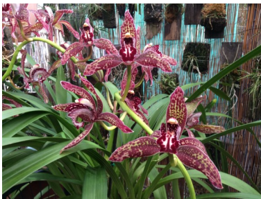
5. Cym. Death Wish 'So Spotted'