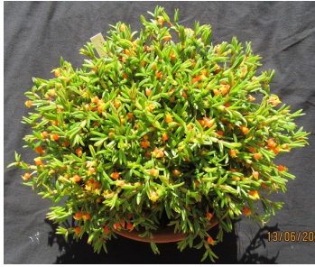
2. Medicalcar decoratum