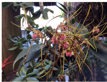
7. Den. tetragonum