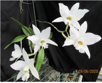
1. Laelia anceps var. delicata 'Helen' HCC/AOC