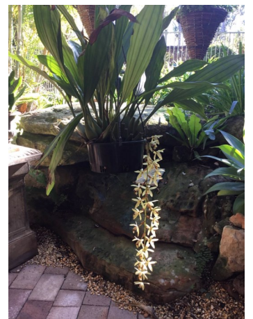
11. Coelogyne unknown