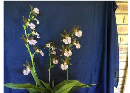
10. Spec. Zygotataium erinitum