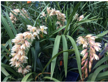
4. Cym. April Showers 'April'