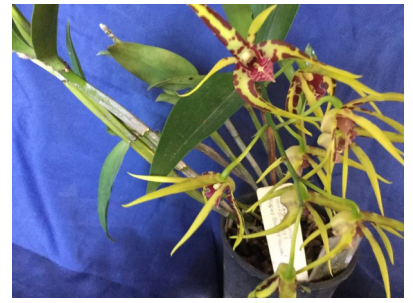
8. Den. Australian chocolate starfish bronze Desmond sparkler 'Greg Hall'