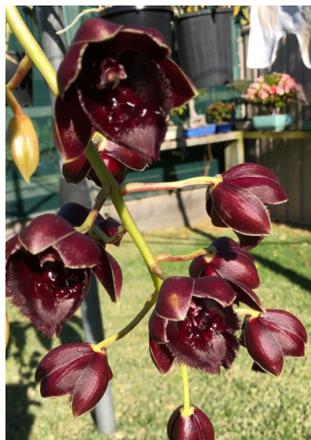
13. Fdk. Saturn Sky 'SVO' x Ctsm. Susan Fuchs 'Burgundy Chips' FCC/AUS