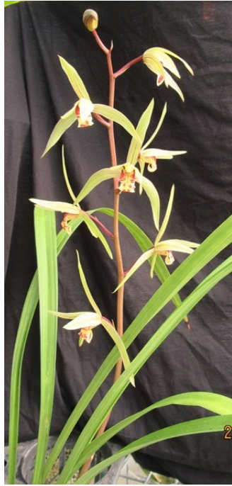
3. Cym. kanran formosana