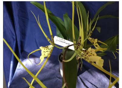
9. Brassica gireoudiana