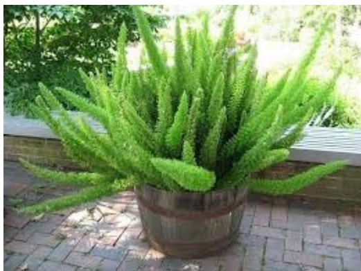
Foxtail fern needed by Anne-Marie Collins, for floral art.