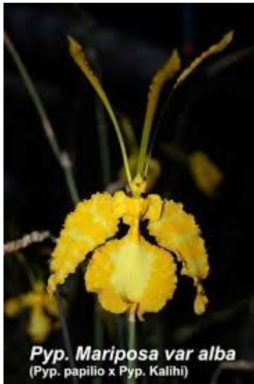
Pyp. Mariposa var alba (Pyp. papilio x Pyp. Kalihi)

The committee would like to thank those generous members that provide the goodies for afternoon tea and also the members who bring in plants etc. for our monthly raffles. Also we thank the people who help set up and clean up the hall as with many hands it doesn't take very long.