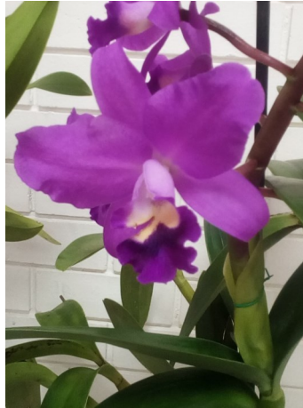
13 close up.