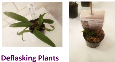
Deflasking Plants brought in.