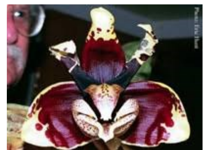
STANHOPEA—featured in Novice section.

Bank details for our society, if you wish to pay by direct deposit or over the counter.