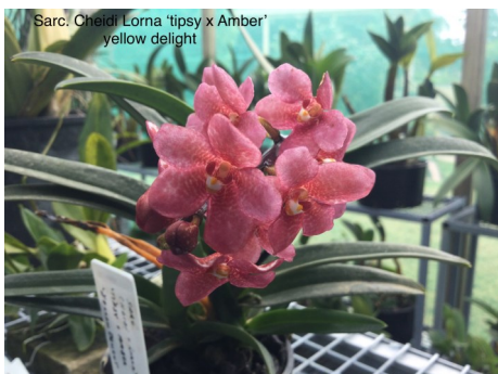
Sarc. Cheidi Lorna "tipsy x Amber" yellow delight