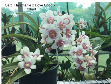
Sarc. Hantmanie x Dove Good x Fitzhart