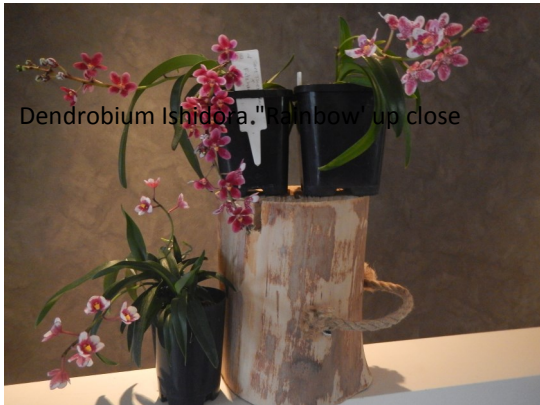
Dendrobium Ishidora "Rainbow" up close

NOVICE —well done to the novices who sent in their orchids.