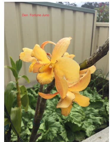
Den. Fortune Juno