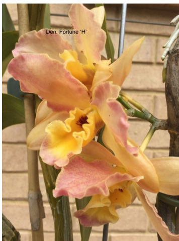
Den. Fortune 'H'

INTERMEDIATE — a lot of time put into these orchids—well done.