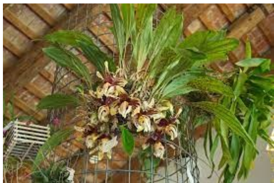
Stanhopea—view , looking up. They need to be able to flower from underneath. A.M.

The committee would like to thank those generous members that provide the goodies for afternoon tea and also the members who bring in plants etc. for our monthly raffles. Also we thank the people who help set up and clean up the hall as with many hands it doesn't take very long.