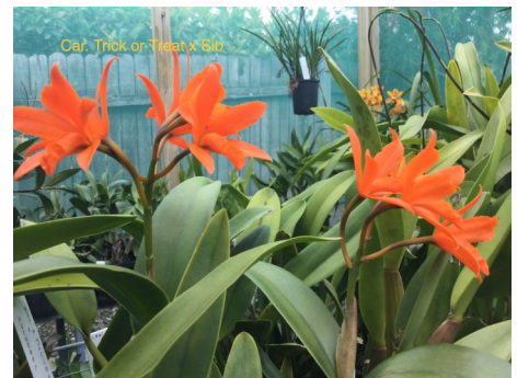
Car. Trick or Treat x 616