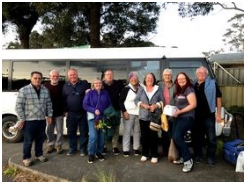
Bus trip to Orchids Out West.