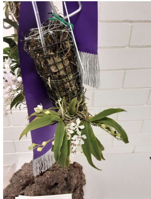
Sarc. Falcatus Purple Chin—M. & B. McIntosh