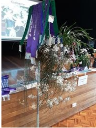
Dockrillia Jiggi