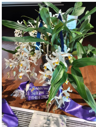
Coelogyne Unchained Melody