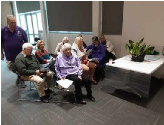
More Winter Show 2023 winners