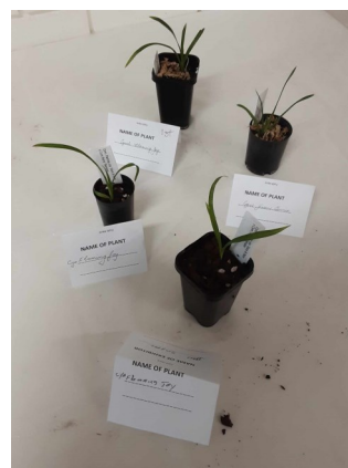
First—back, left hand side.

Novices are asked to bring their deflasked plants. We hope they have done well.