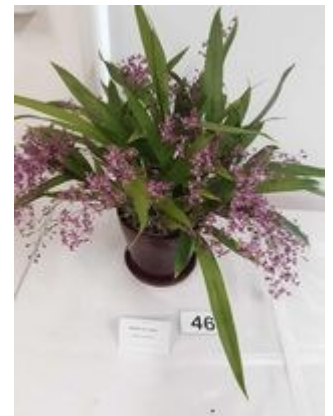
No. 1—top left