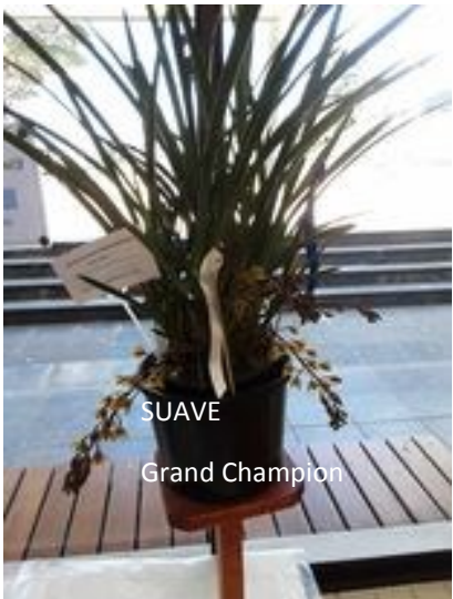
SUAVE Grand Champion