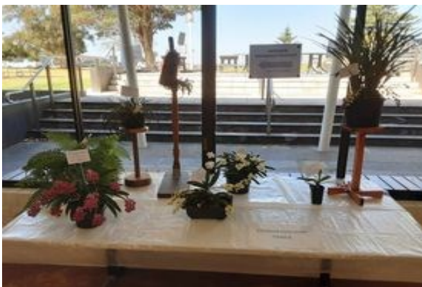
2023 Native Show Champions.