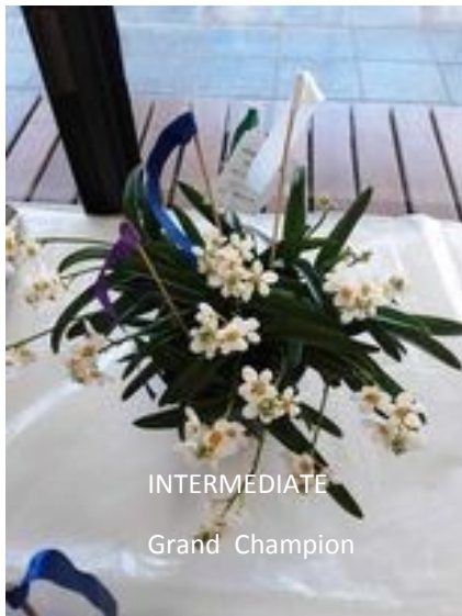
INTERMEDIATE Grand Champion