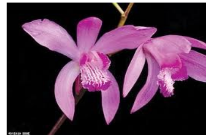
Christmas Party orchid and gardening baskets for the raffle.