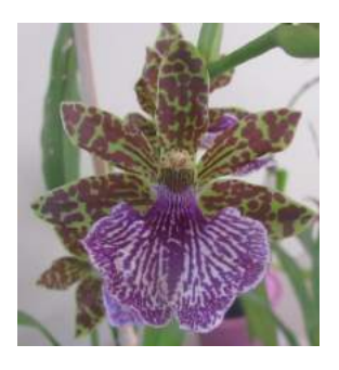
Popular Vote Open: