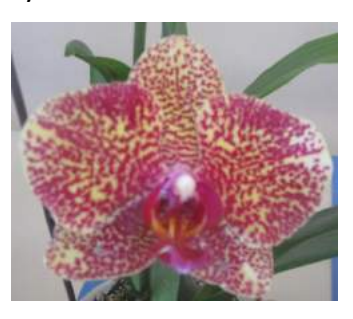
Popular Vote Novice: