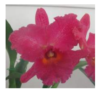
Popular Vote Open: