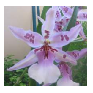
Popular vote; 2nd