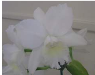
Popular Vote Open: