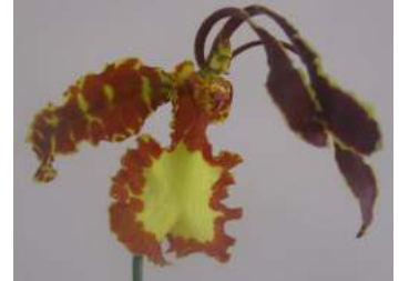
Popular Vote Novice: