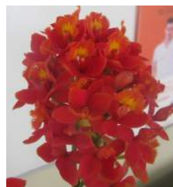
Popular Vote Open: