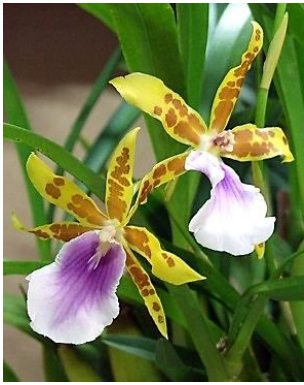
Miltonia Goodale Moir 'Golden Wonder' Grown by Hugh & Belle Strain