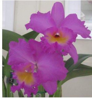
Popular Vote Open: Sylvia Hawkins