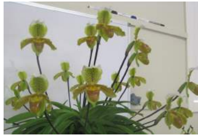
Popular Vote Open: Gary McConnell