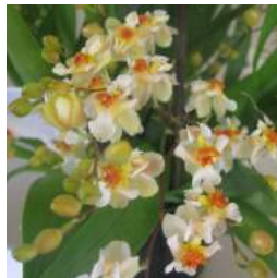
Popular Vote Novice: Alan Coulton