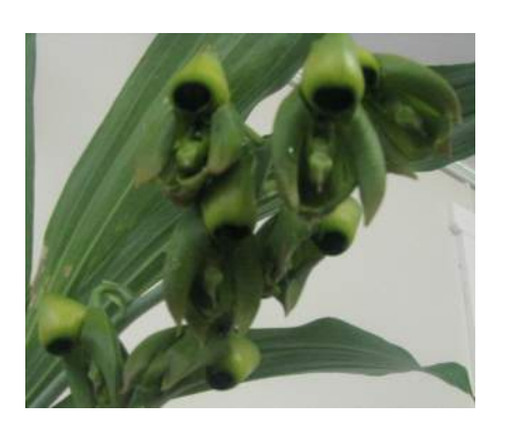
This strange looking orchid also belongs to Liz Cleaver & Tony Groube