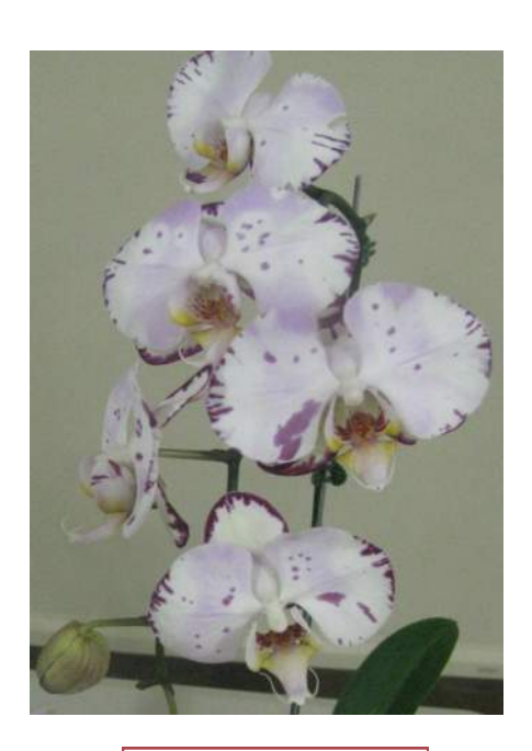
Novice Popular Vote: Ron Cox