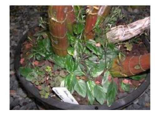
paint on the glysophate