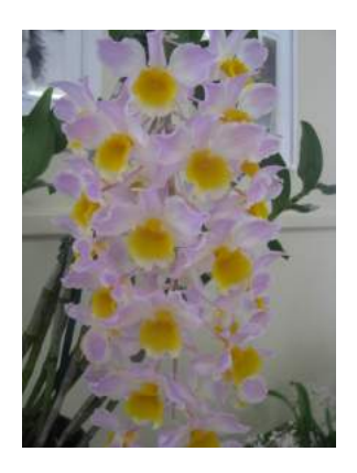
Popular Vote Open: Sylvia Hawkins