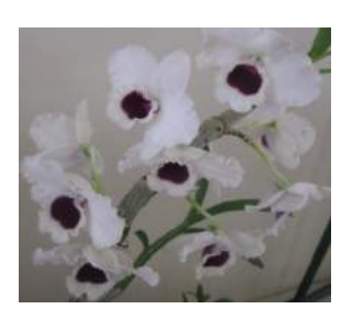
2nd Novice Popular Vote