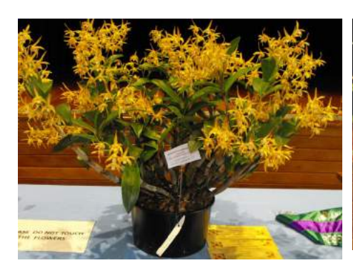
Champion of the Spring Show Eddie & Karen Ruiz

PAPHIOPEDILUM'S can now be moved along into new media, by the time you trim the old dead roots off, the plant may go back into its original pot. Pack the mix tightly around the plant. DO NOT POT YOUR PLANT TOO HIGH. Giver plants a bit more shade for this late spring to early summer period. DO NO let the plants dry out. Fertilise every two weeks at the moment using MERRI FERT at half rate. Watch for scale.