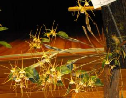
Reserve Champion of the Spring Show