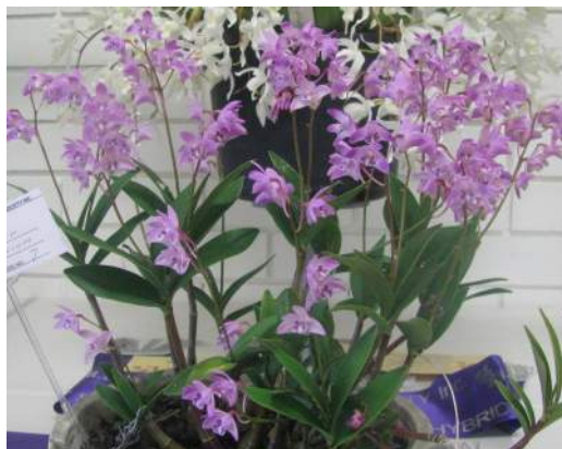
Champion Novice: Doreen Cambourn