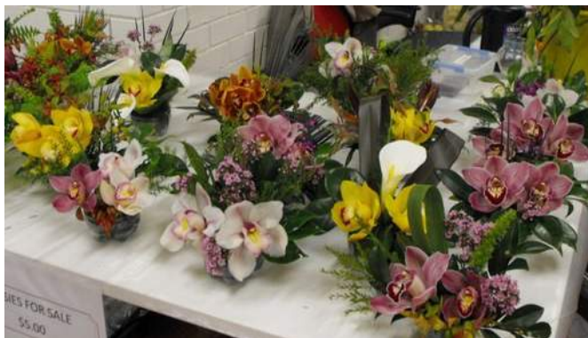
POSIES FOR SALE AT THE SHOW